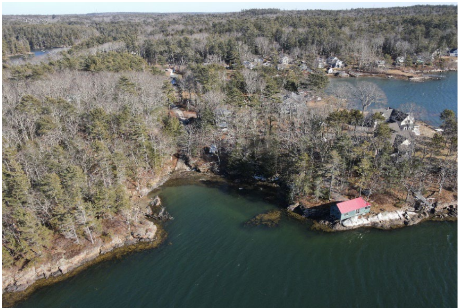
Sabino Landing in West Bath, Maine