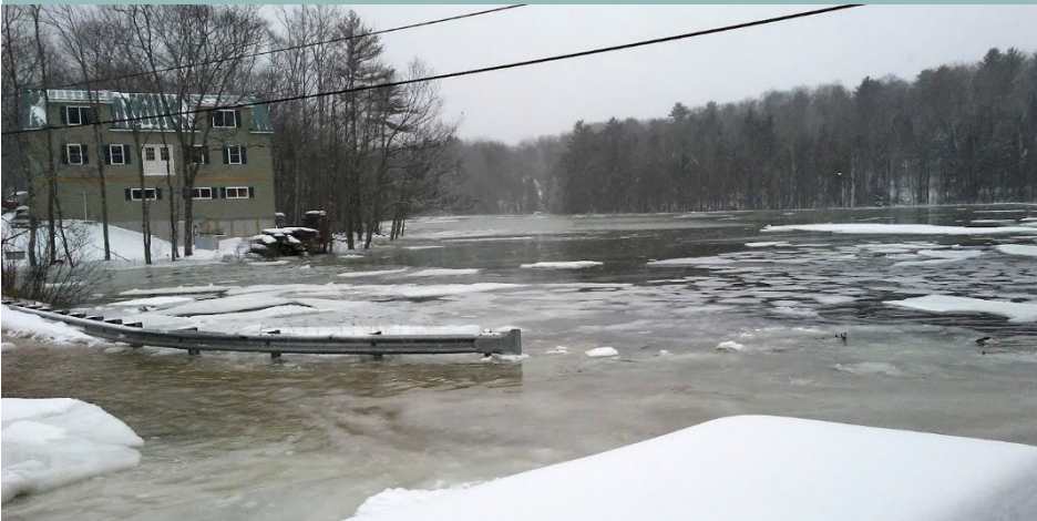
Coastal Flooding Inundates Wallace Shore Road in Harpswell, Maine

The New England Environmental Finance Center partnered with the Casco Bay Estuary Partnership and the coastal towns of Harpswell, Phippsburg, and West Bath (together the 'coastal cohort') to help the three towns prepare for the effects of climate change and secure initial funding for shared coastal resilience priorities. As leaders of small, peninsular communities reliant on natural resource economies and home to aging populations, town administrators and staff sought to better understand climate impacts like sea level rise, storm surge, flooding, and erosion and identify associated adaptation strategies and funding sources.