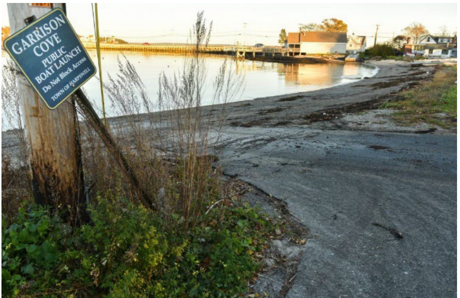
Garrison Cove Town Landing in Harpswell, Maine

Participating in this facilitated process formed new relationships and established a foundation for regional collaboration, which led the three towns to craft a joint proposal for funding to advance shared priorities. The coastal cohort successfully secured funds from the Maine Governor's Office of Policy Innovation and the Future for engineering services to assess three town landings/wharfs and their vulnerability to current and projected sea level rise, storm surge, and King tide events to inform a maintenance and upgrade plan for improved resilience. Selected town landings included Garrison Cove in Harpswell, Acre Lot Wharf in Phippsburg, and Sabino Landing in West Bath. Preliminary designs and cost estimates resulting from these analyses will position the towns to jointly seek additional state or federal funding for implementation.